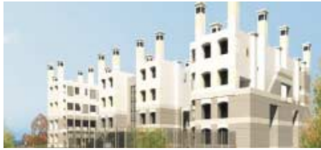
Hyderabad Institute of Technology and Management (HITAM) Hyderabad (LEED Silver)

As most Core and Shell class projects are intended for renting out the space, LEED C&S offers a unique marketing tool. By documenting their green design and sustainable construction management plans, C&S developers can go for an optional endorsement of their intent to go for LEED Green building rating from the IGBC.