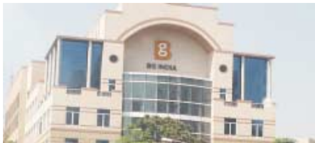
Hiranandani BG House Mumbai (LEED Platinum)

A longfelt need to have an indigenised rating system was fulfilled with the launch of LEED India (Leadership in Energy and Environmental Design) New Construction in January 2007. The LEED India rating system has incorporated all the prevailing Indian benchmarks for building performance.