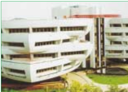
L&T ECC Division, EDRC I Building Chennai (LEED Silver)