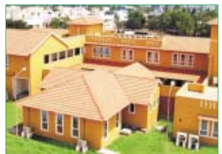
Rane Institute For Employee Development, Chennai (LEED Silver)

The list of the Rated/ Registered Projects follows: