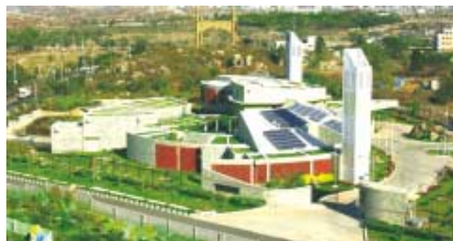
CII - Sohrabji Godrej Green Business Centre Hyderabad (LEED Platinum)