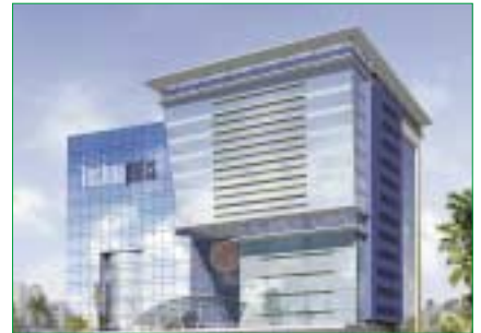
Technopolis Kolkata (LEED Gold)