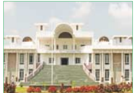
IGP Office Complex Gulbarga (LEED Gold)