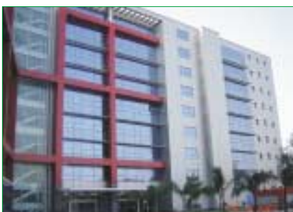
ABN Amro Central Enterprises Chennai (LEED Gold)