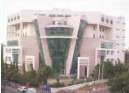
Wipro Technologies Gurgaon (LEED Platinum)