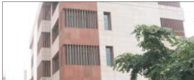
Spectral Services Consultants Pvt. Ltd. Noida (LEED Platinum)

The various rating levels in the rating viz. 'Platinum', 'Gold', 'Silver' and 'Certified' are awarded in recognition of the extent to which the building outperforms the expectations of the national codes. LEED-India rated buildings would meet specifications of the National Building Code 2005, MoEF guidelines, Central Pollution Control Board norms, and the Energy Conservation Building Code (ECBC) of the BEE.