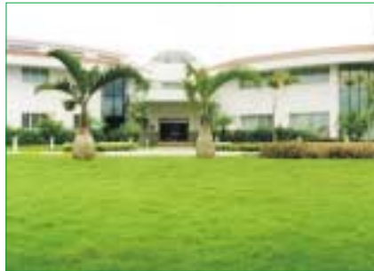
Vestas Wind Technology Chennai (LEED Gold)