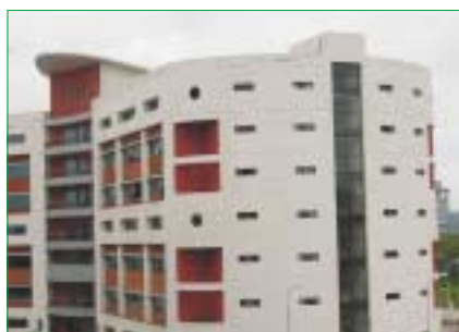
Wipro Technologies Kochi (LEED Gold)