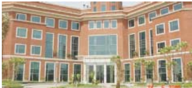
ITC Green Centre Gurgaon (LEED Platinum)

Being a holistic system, LEED India rating can be applied to all types of buildings including the naturally ventilated one. Variants like NC (New construction) CS (Core and Shell) etc are available to fit the scope of the projects. Variants for homes and enlisted buildings are being developed to cater to the growing interest in these sectors.