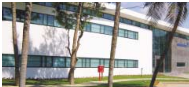
Grundfos Pumps India Pvt. Ltd., Chennai (LEED Gold)

As on date more than 160 buildings have been registered under the LEED rating system, with a Built-in area of 101 million sq.ft. These include variety of buildings namely IT Parks, Commercial Buildings, Corporate offices, Airports, Hotels, Showrooms, Malls, Banks, Government Offices, Schools and Colleges.