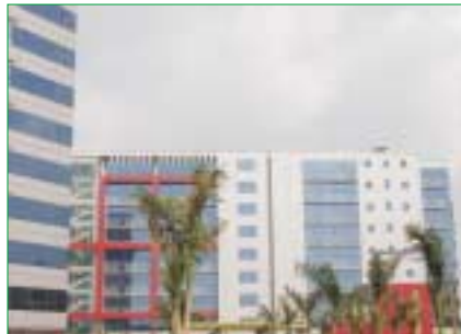
Olympia Tech Park Chennai (LEED Gold)