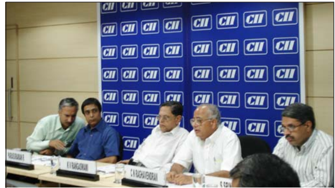
Launch of Chennai Chapter, 8 October, 2005

The members of the local chapters will include corporates, Government bodies, Nodal Agencies, Non-Profit organizations, Small organizations including architects, consultants, interior designers, Institutions and Material & equipment manufactures.