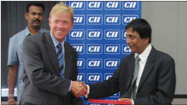
Exchange of MoU

The MoU was exchanged between Hon. John Thwaites, Deputy Premier and Minister for Environment and Water, Government of Victoria, Australia and Mr. ParasuRaman R, Chairman, IGBC & Vice-Chairman, WGBC (World Green Building Council).