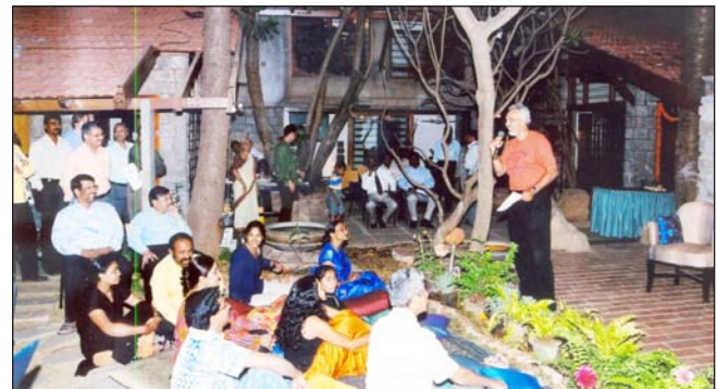
Launch of Bangalore Chapter, 23 February, 2006.