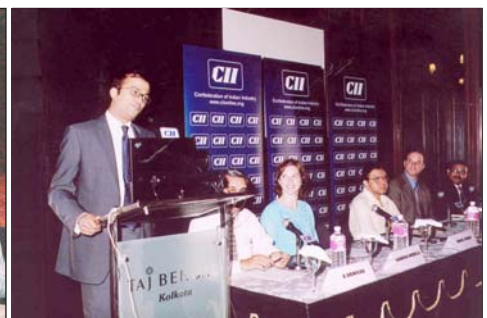
Launch of Kolkata Chapter, 12 May, 2006