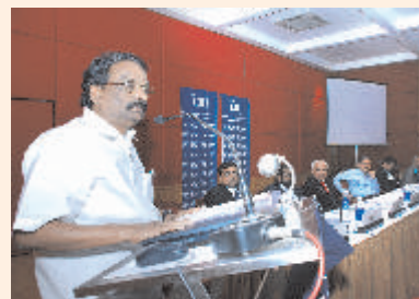
Shri A K Balan, Hon'ble Minister for Electricity & Welfare of Backward and Scheduled Communities, Government of Kerala delivering the special address

The ninth local chapter of Indian Green Building Council (IGBC) was launched by Shri A K Balan, Hon'ble Minister for Electricity & Welfare of Backward and Scheduled Communities, Government of Kerala on 17 January 2009 at Kochi. The launch witnessed participation of 280 stakeholders. Ar B R Ajit would Chair the Kochi chapter activities.