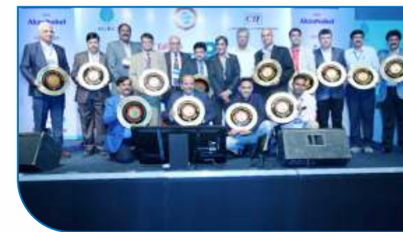
Participants visiting the exhibition space at the GreenPro Summit