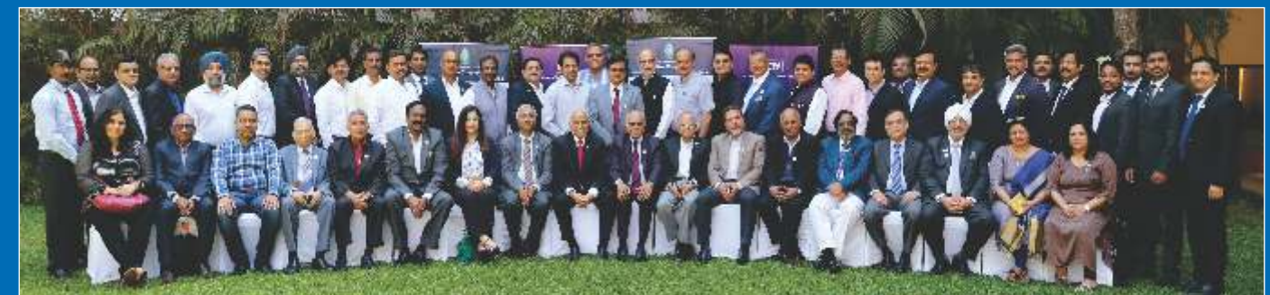
IGBC Executive Board Members Meeting, 3rd February 2018, Goa