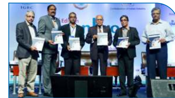
Release of manual on GreenPro certification for Ready-mix concrete.