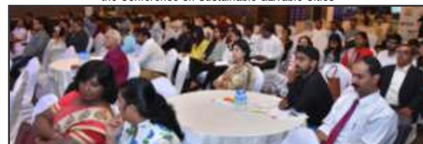
Participants and audience during Conference

CII IGBC Vidarbha Chapter jointly with Shree Datta Meghe College of Architecture (SDMCA) organized a Conference on Sustainable & Liveable Cities on 19 April 2018 at Hotel Center Point, Nagpur