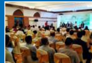
Participants at the CII Goa Environment Conclave