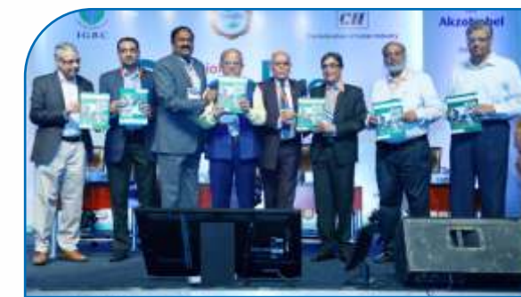
Release of CII- GreenPro Reference Manual

Thirteen Leading Companies ACC Ltd., Kesavaram Cement, Godrej & Boyce etc have received GreenPro certification for their products, materials and technologies in the GreenPro Summit held at Hyderabad. So far more than 375 products across 18 product categories from over 60 companies have received the GreenPro certification. During the conference, CII has released a reference manual on GreenPro, which will act as a single point reference for the product manufacturers, to implement green measures and make their product green. The manual has been developed with the support of United Nations Industrial Development Organization (UNIDO). CII & UNIDO will jointly work together in developing GreenPro certification for Industrial products as well. CII has also partnered with Quality Council of India & Ready-mix concrete manufacture association (RMCMA) to develop GreenPro certification for ready-mix concrete. This initiative has been supported by International Finance Corporation (IFC). IFC has also shown interest in supporting entrepreneurs to establish manufacturing units to convert construction & demolish waste into useful construction products. This will support Hyderabad City & Telangana as a whole to address the construction & Demolish waste generated. More than 15 manufacturers & technology suppliers have displayed their product & technologies in the conference. The conference attracted 40 speakers and more than 200 delegates from across the country.