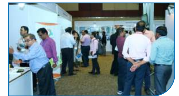
13 leading companies receiving GreenPro Certification