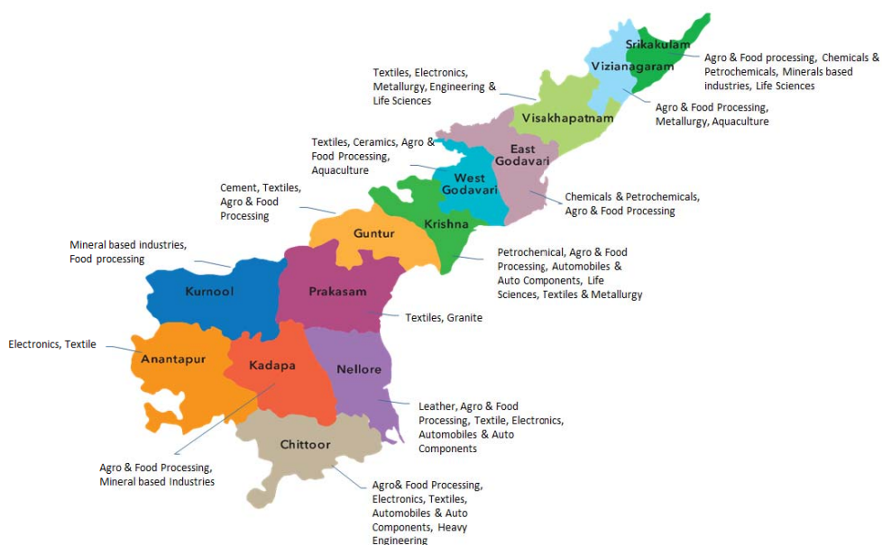
Chart 1: Sector wise major districts by output

Andhra Pradesh, over the years, has established a strong presence in agro and food processing, textiles, chemicals & petrochemicals, pharmaceuticals, metallurgy, electronics and electrical engineering sectors.